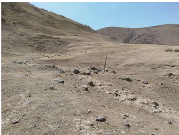
Reservoir location, Jany-Turmush (Baul) village

What is the desirable level, frequency and extent of environmental monitoring during the operational phase? Semi-annual