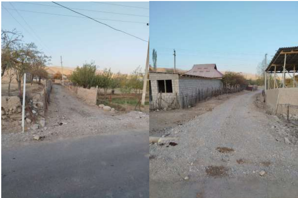
Zhany-Turmush (Baul) streets