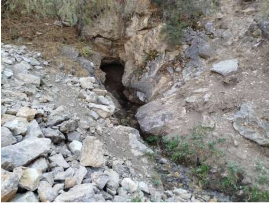
Reservoir location, Jany-Turmush (Baul) village