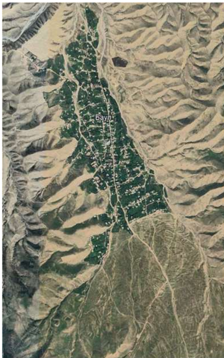
Figure 2. Village location.