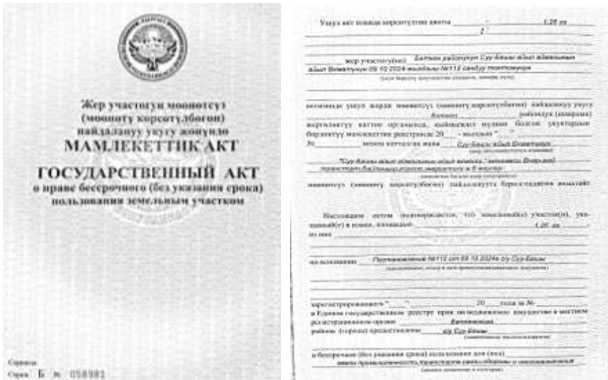
Figure 4. Copy of the State Act of the construction site of the WSS.