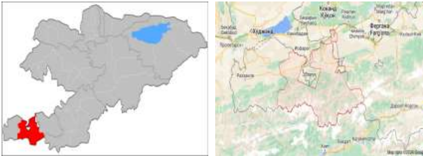
Figure 1. Location of Batken rayon

Batken rayon includes 9 aiyl aymaks and 47 villages.