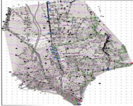
Figure 3. Distribution network diagram of the village of Kara-Bulak.